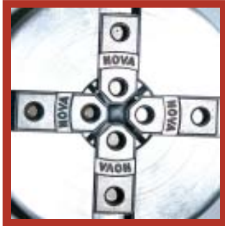
The Nova Jaw Slide (set of 4) in a Teknatool Chuck body

The Teknatool Nova Range of Chucks have the Nova Quality and Design thinking, right down to the smallest component.